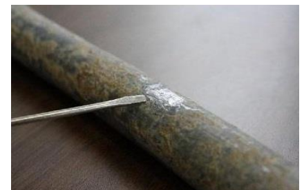
Sample Photo 2