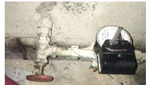
Sample Photo 1

Email this filled-out PDF along with your two photos to ellicottville@evlengineering.com